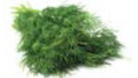
HOT OR COLD FORK BUFFETS