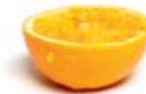
REFRESHMENT DRINKS & BREAKS

The range of menus we offer has been carefully designed to answer the occasion, whether it's creative canapés for an exclusive reception, or an unhurried lunch for 300 delegates with limited time to spare.