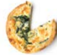
WORKING LUNCHES & SUPPERS